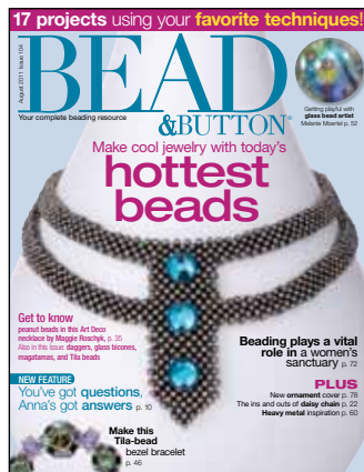
#104 – August 2011

Y Yamada, Emi, 105:78 Yamamoto, Yukiko, 105:15 (YW) Yanagi, Sheryl, 106:90