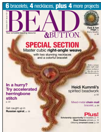
#105 – October 2011