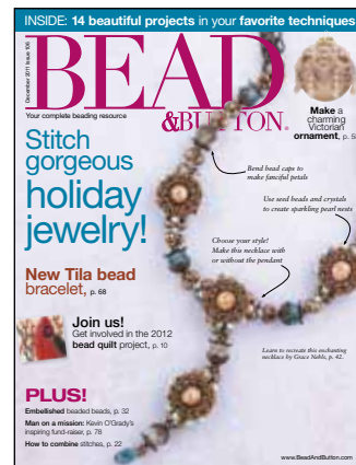
#106 – December 2011