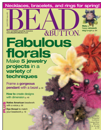
#90 – April 2009