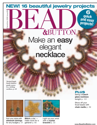
#94 - December 2009