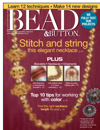
#93 - October 2009