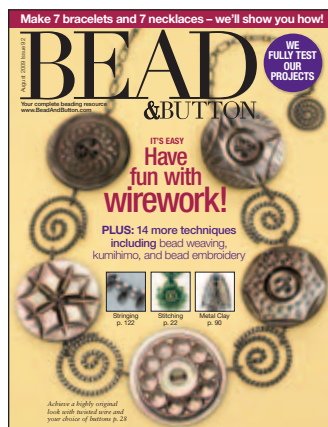
#92 - August 2009