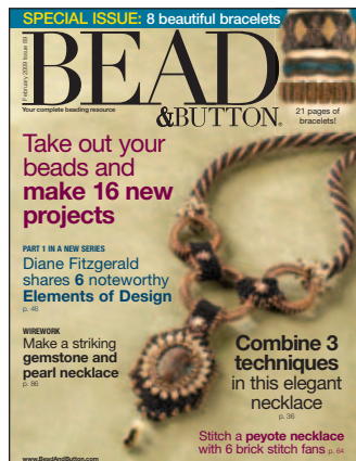
#89 – February 2009

earrings, 91 :130; 92 :122; 94 :51; Feb. :ONS; June :ONF; June :ONS; July :ONF Ellsworth, Rev. Wendy, 93 :15 (YW) Expert Advice Coaxing creativity, 94 :16 Color outside the Fireline, 90 :18 Necklace fitting 101, 93 :16 Simple soldering, 89 :18 Tips for successful beadwork, 91 :22 Unhand that shank, 92 :16