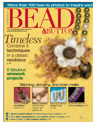
#91 – June 2009